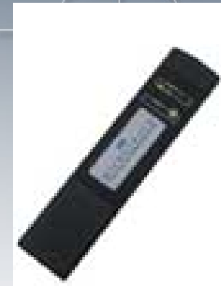
Audible Detector -