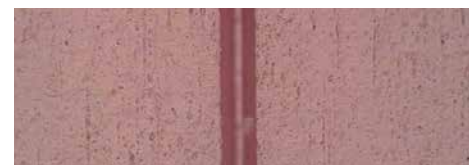
nyloprint® WS 73 Digital

Please contact us for additional information.