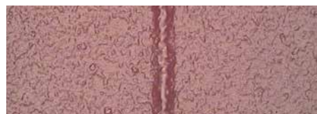
nyloprint® WS 73