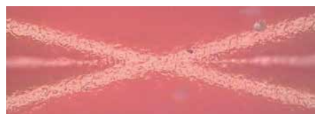
nyloprint® WS 73